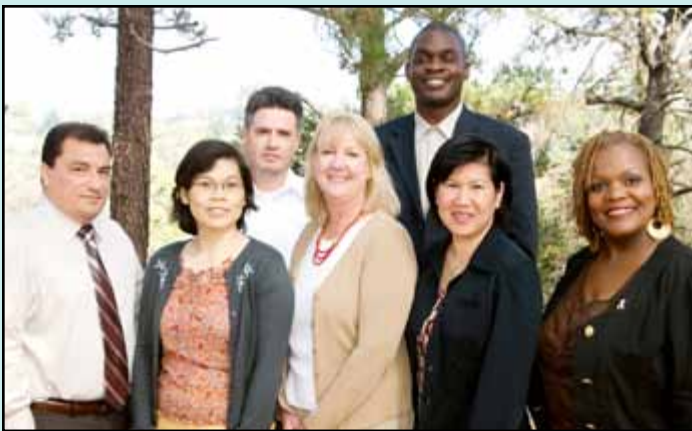
Foothill College EOPS Staff & Faculty