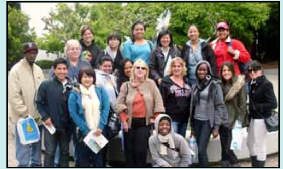
Foothill College EOPS students tour UC Santa Cruz.