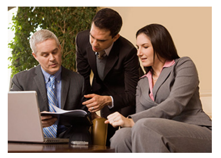
These managers typically have previous work experience in advertising, marketing, promotions, or sales.

A bachelor's degree is required for most advertising, promotions, and marketing management positions. These managers typically have work experience in advertising, marketing, promotions, or sales.