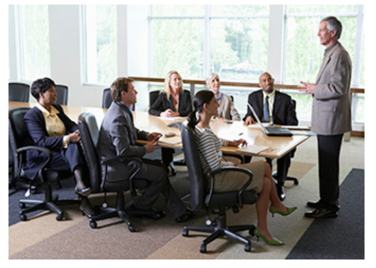
Advertising, promotions, and marketing managers may travel to meet with clients or representatives of communications media.

Advertising and promotions managers held about 31,300 jobs in 2016. The largest employers of advertising and promotions managers were as follows: