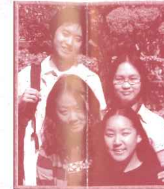
APIH Month 2005 Co-Chairs