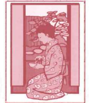
Japanese Tea Ceremony