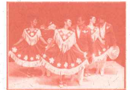
Ensamble Ballet Folklorico de San Francisco