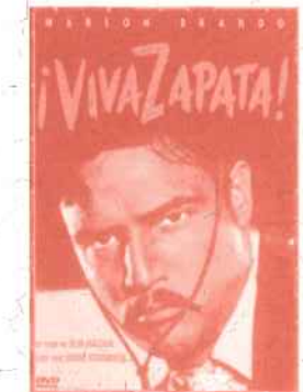
Film: ¡Viva Zapata!