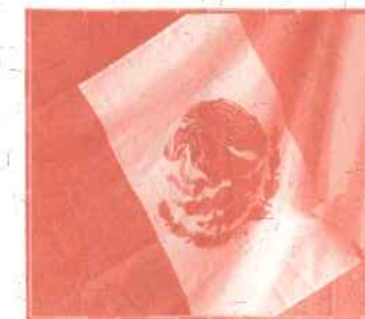
Cinco de Mayo Luncheon