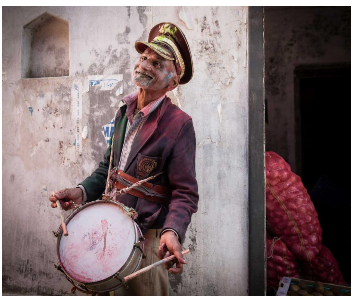
Holi Drummer. Photo by Jacque Rupp, India, 2015

The Corrective Lens is a photography exhibition that celebrates the diversity of cultures and people from around the world and offers a message of unity.