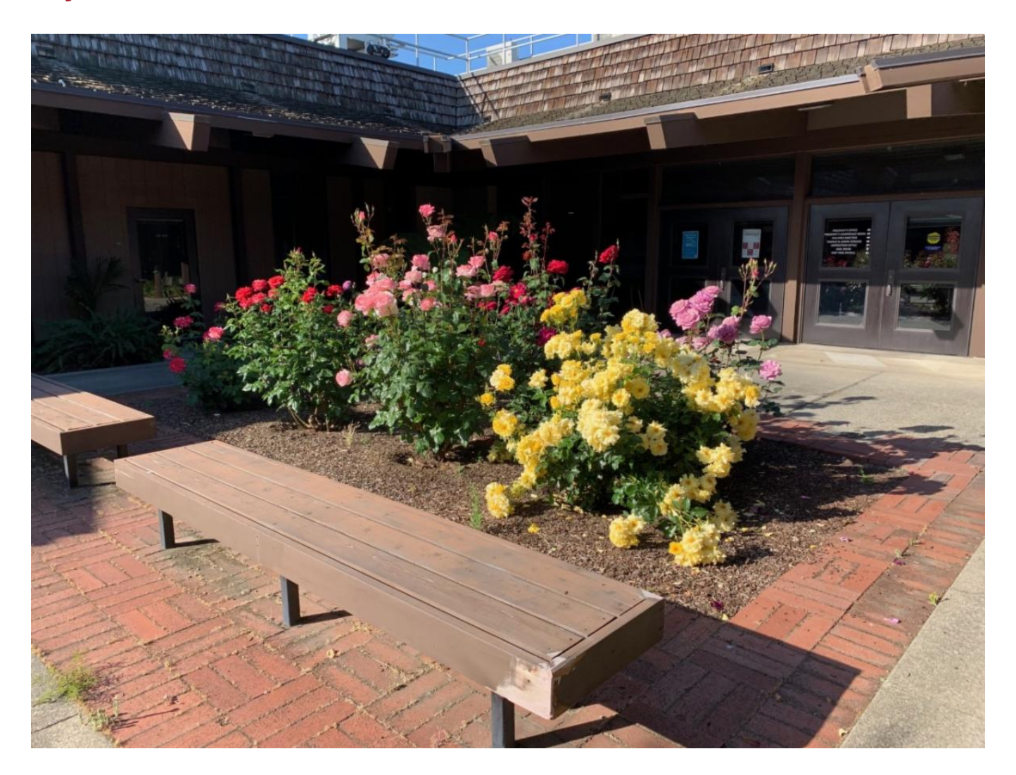
INTRO TO COME.