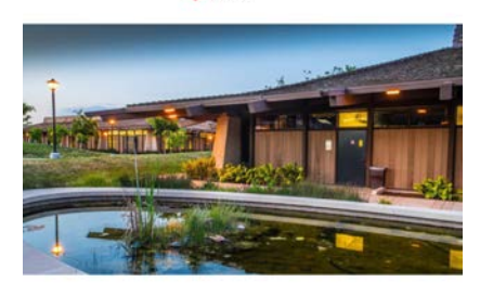
Ethnicity & Race in Academia

A toolkit created by Students for Faculty, Staff, and Administration.