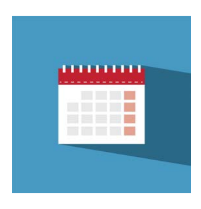
Friday, Oct. 2: The last day to add 12-week, quarter-length classes. See academic calendar

The Association of Independent California Colleges and Universities, comprised of 85 independent, nonprofit colleges and universities, will present short live sessions to allow students to learn more about the school. Please encourage students to register. View the schedule