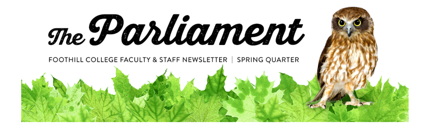
May 21, 2021