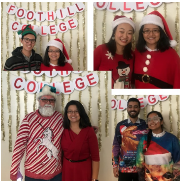
Santa works at Foothill!