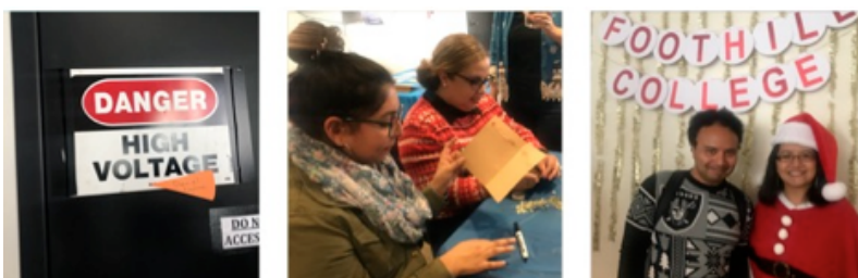
Our first-year faculty members came out for some much deserved holiday fun. I apparently did not steer